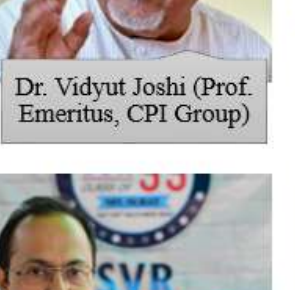
SVR ASS OF 99 NON-2018