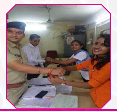
Rakshabandhan celebration at Anandnagar & Satellite Police Station